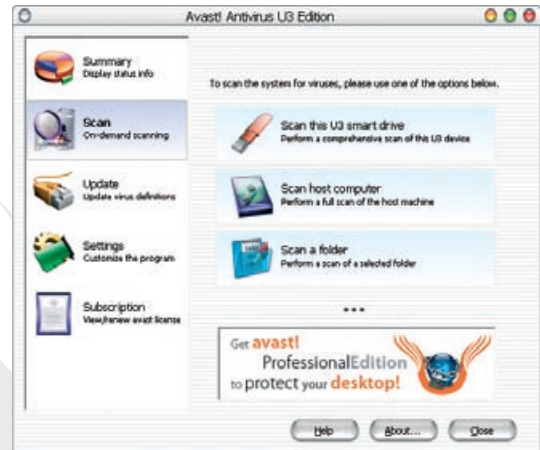
screenshot of avast! antivirus U3 program (Scan)